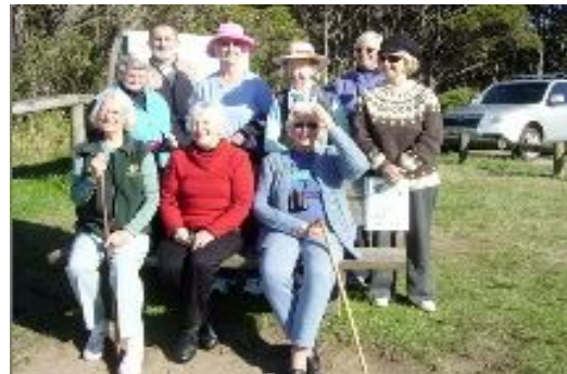
A happy group of U3A Ramblers pictured recently at Crackneck Lookout