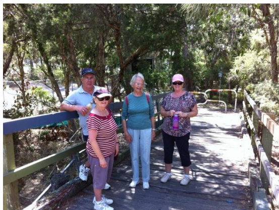
Members of our Walking Group crossing the bridge at Tumbi Creek outfall on 4th February.